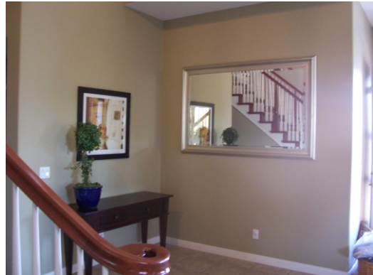
The mirror which was seemingly permanently affixed to the wall was "worked around" as I created a simple entry using what the owners had in about ten minutes.

Sometimes entrances need more than just a simple set up. If you have a narrow, low ceilinged entrance remember our Problem Area Rules Above and cosmetically fix the area if you can ahead of time: