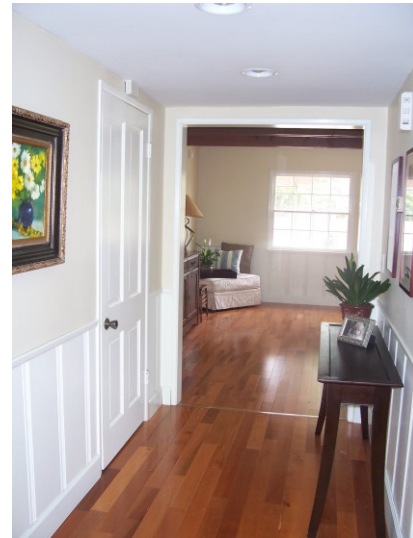
The difference paint can make! An inexpensive Target table creates a focal point that is not so wide that it blocks the area.

If the space allows, add a bench or other seating, like extra chairs from a formal dining room, in order to convey a sense of space.