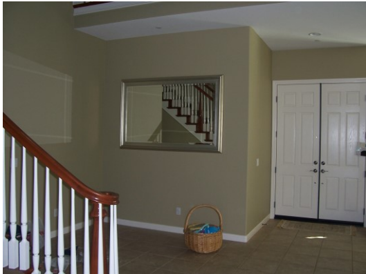
In this home, the grand double door entrance was stark and empty

When one enters into a home, a transition is expected--no matter how small--from the entry to the living areas. In homes where you literally walk straight into the living area, creating an entry , much less a focal point for the entry is a difficult task. Use the wall adjoining the front door to create a small entrance focal point: set a bedside or console table up with a mirror or picture and some chosen accessories.