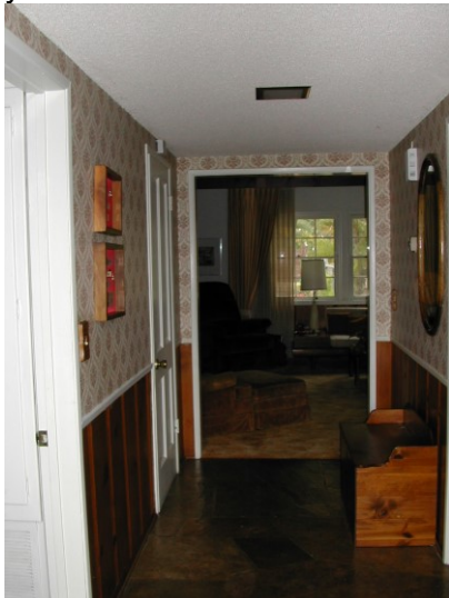
This entrance breaks all the rules!

Sometimes entrances need more than just a simple set up. If you have a narrow, low ceilinged entrance remember our Problem Area Rules Above and cosmetically fix the area if you can ahead of time: